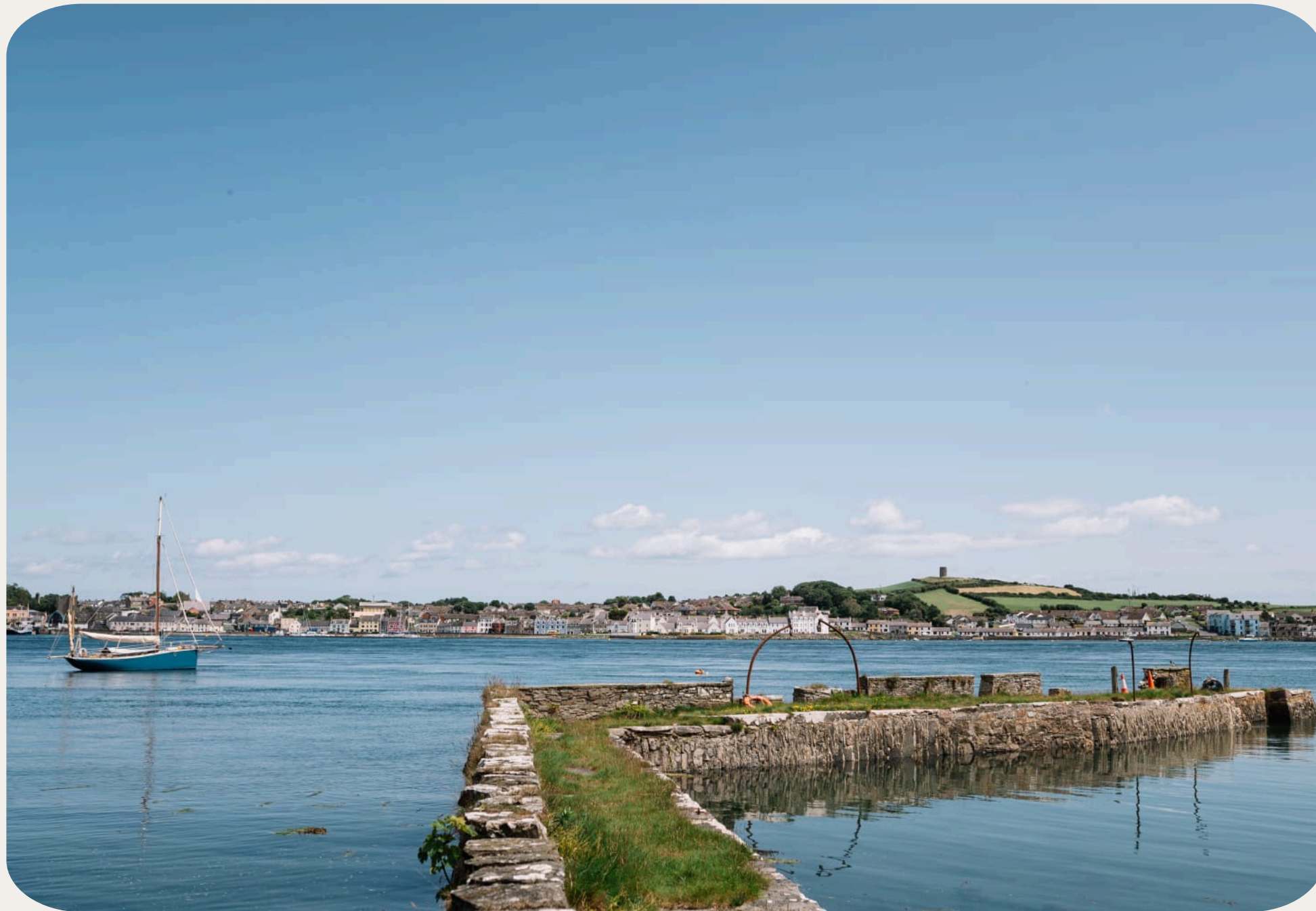
Old Court Strangford Lough

A private waterfront house for immediate family & close friends, overlooking Strangford Lough in the grounds of Old Court.