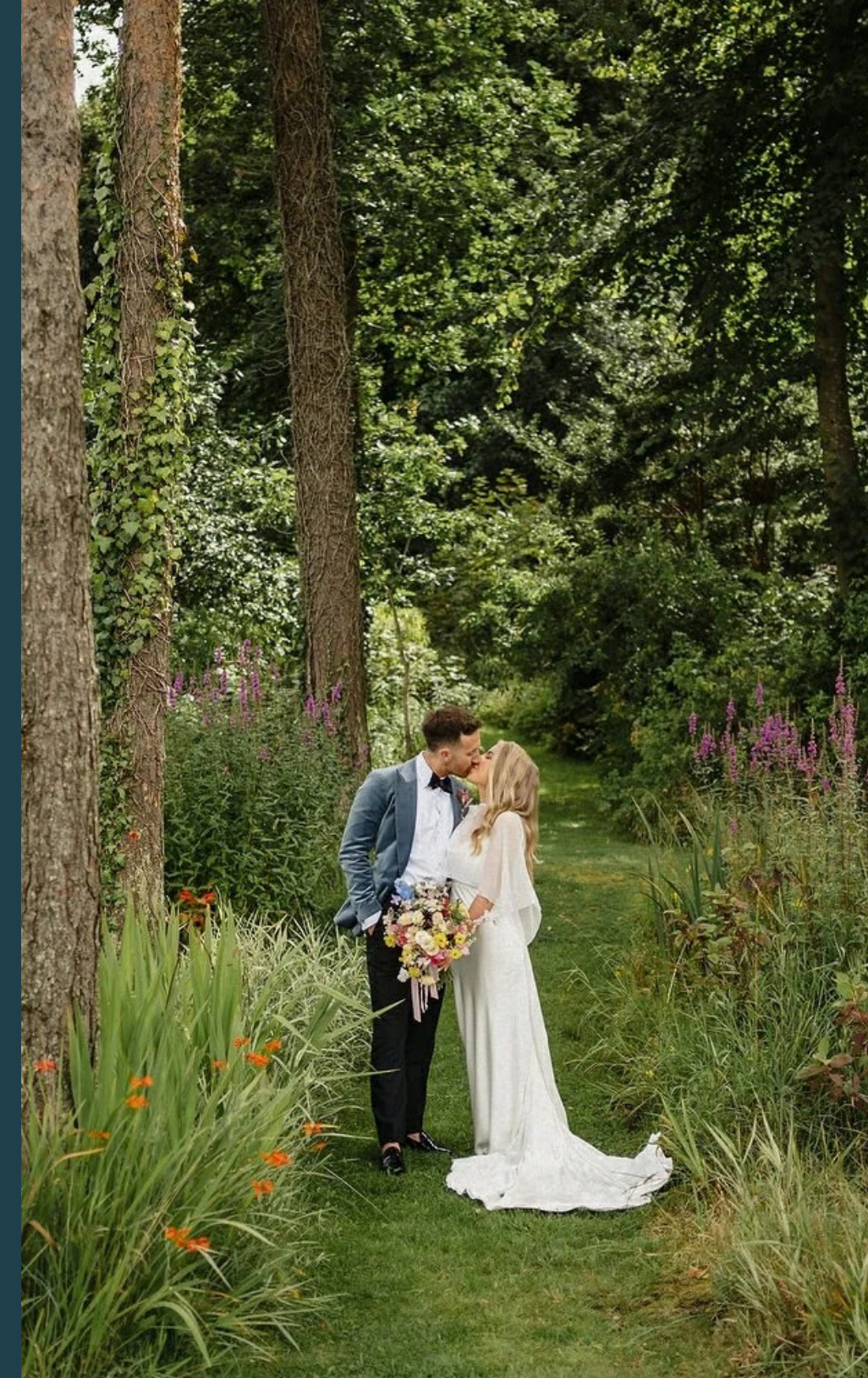
Old Court Strangford Lough