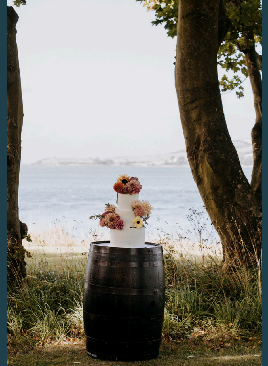
Old Court Strangford Lough