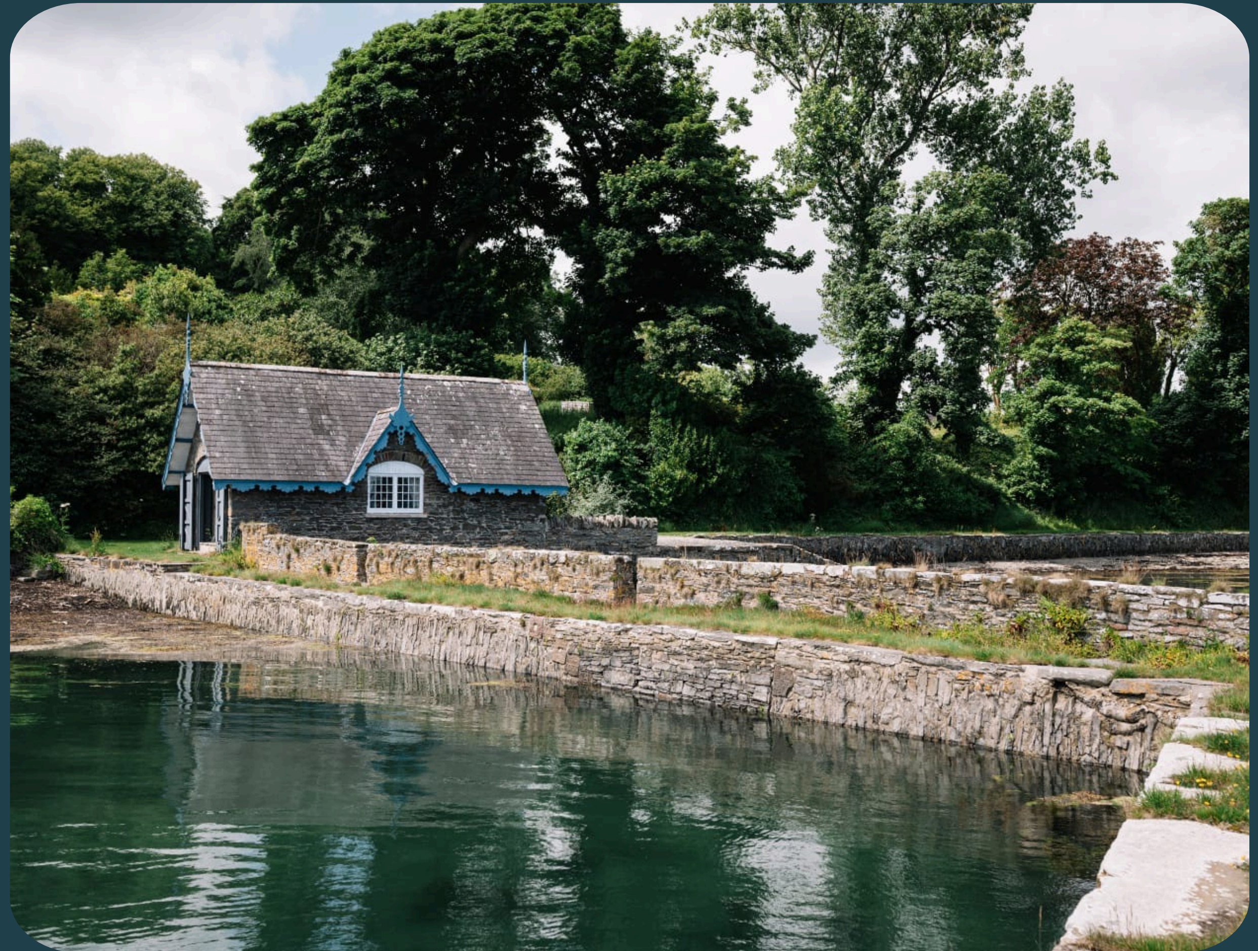
Old Court Strangford Lough

Additional night in The Boathouse £200 Stretch tent in the Garden £700 Second day festivities £2500