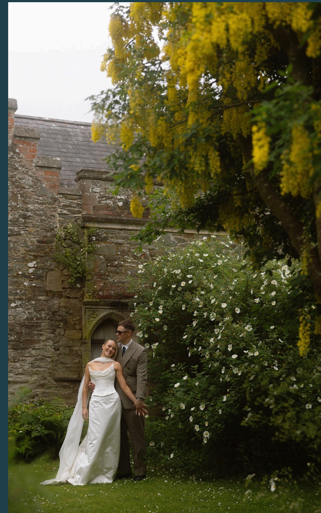
Old Court Strangford Lough