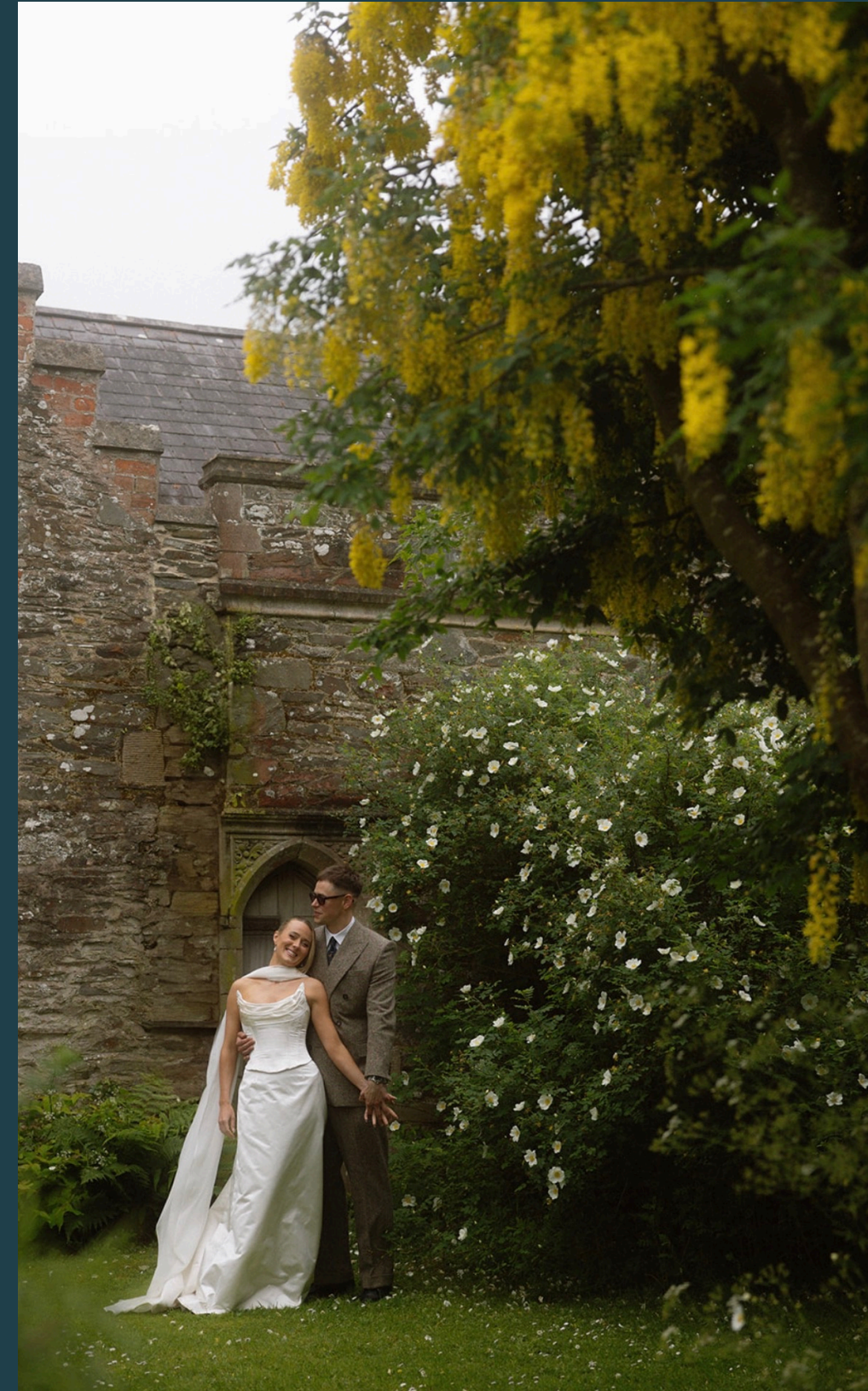
Old Court Strangford Lough